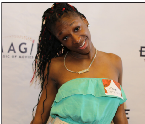
"Life is a box of chocolates, Forrest."