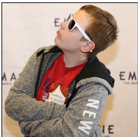
"If you build it, he will come."