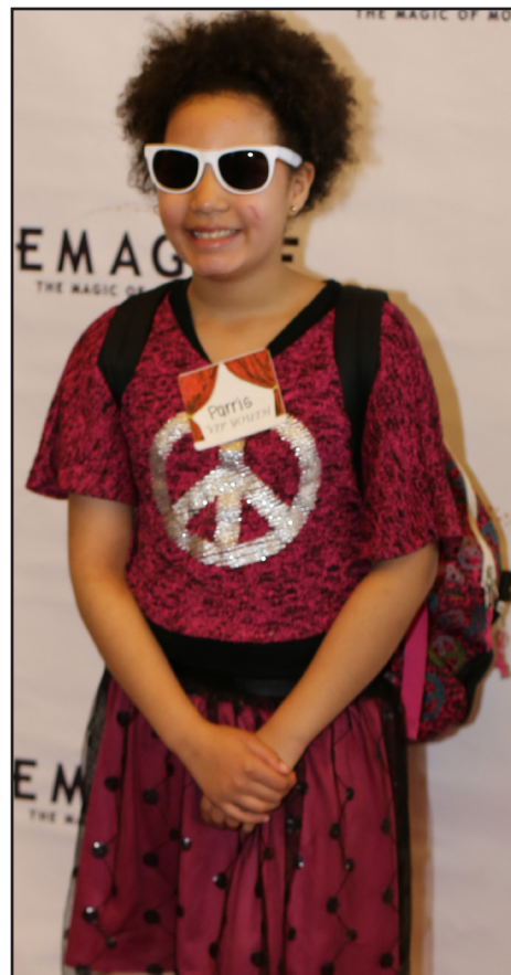
"Toto, I've a feeling we're not in Kansas anymore."