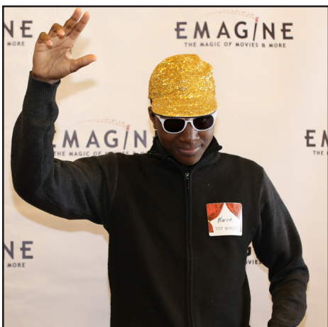
"May the force be with you."