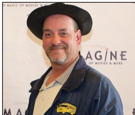
"I'll be back."